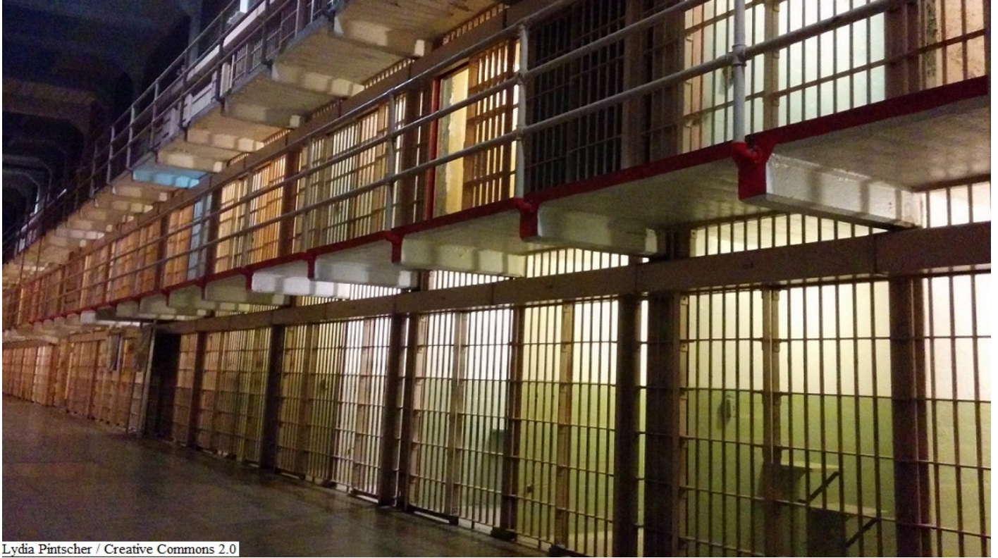
Lydia Pintscher / Creative Commons 2.0

Published on Show-Me Institute ( https://showmeinstitute.org )